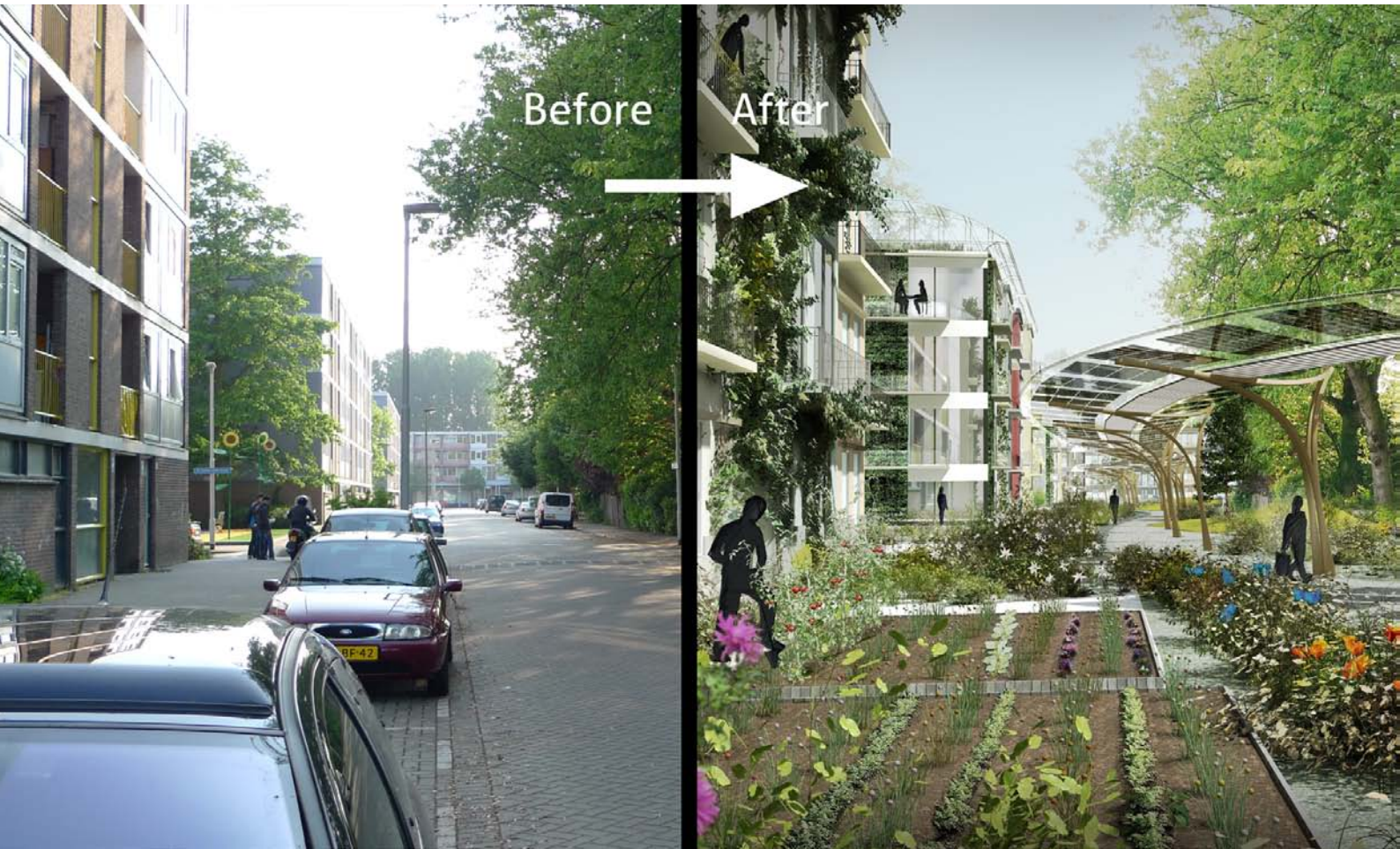
› Example circular urban transformation of social housing in the Netherlands (Except)