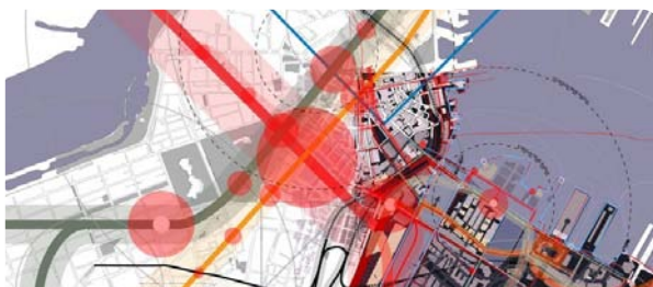
In-depth SiD analysis finds effective strategies for transport, energy, ecology, economy and socially.