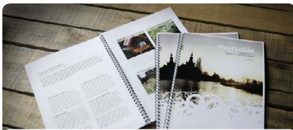
Inspiration books and visions provide starting points for step by step redevelopment.

Urban Renaissance starts small, with cost-effective analysis that detects low-hanging fruit, and easy to implement projects. It then leads the way, step by step, to complete urban renewal.