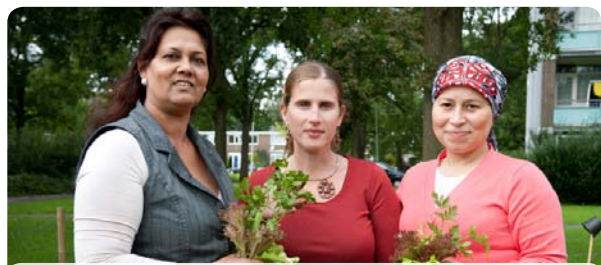
Community participation and urban agriculture for local job creation, and closed-loop neighborhoods.